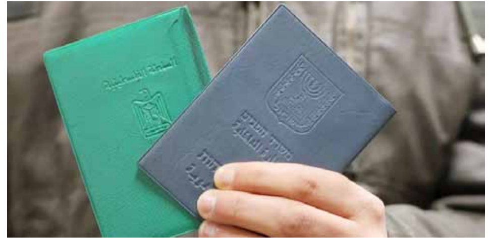
Blue and green are two colors that determine the type of suffering.

Sixteen years later, thanks to the intervention of the youngest child, the double standards of Israeli law, and the bribes paid to lawyers, the other five children were given IDs. Yet, although the